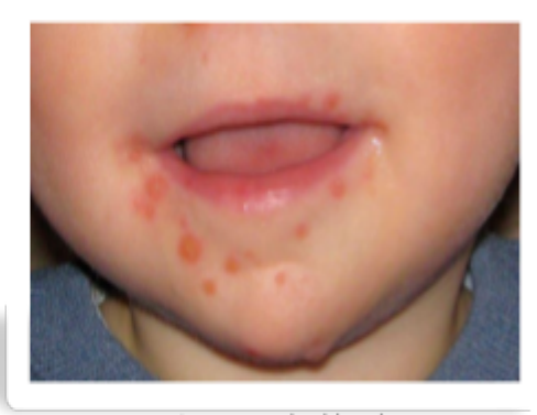
HFMD in 11-month-old male

Treatments for HFMD focus is on providing comfort, relieving pain, preventing dehydration, and strengthening the immune system. Ionic Silver is an immune system stimulator as it disrupts viruses [1,2].